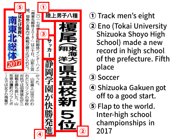
Figure 1: Example of multiple headlines in newspaper. (The Chunichi Shimbun, 2017)

Generation of newspaper article headlines is a kind of summarization tasks of articles. There have been a variety of previous works of headline