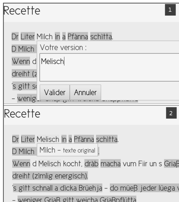
Figure 3: Spelling addition (1) and visualization (2) (highlighted words present at least one additional variant).

terpreted as elements of context. The rules are extracted from each pair of the combination of the aligned variants. From the aligned variants (1) and (2) showcased in Figure 1, four L+R rules are extracted: LR ↔ LER ; RÏE ↔ RIE ; EWL ↔ EBL ; HE$ ↔ HA$. The eight left-and-right-context-only corresponding rules are deduced from the L+R rules.