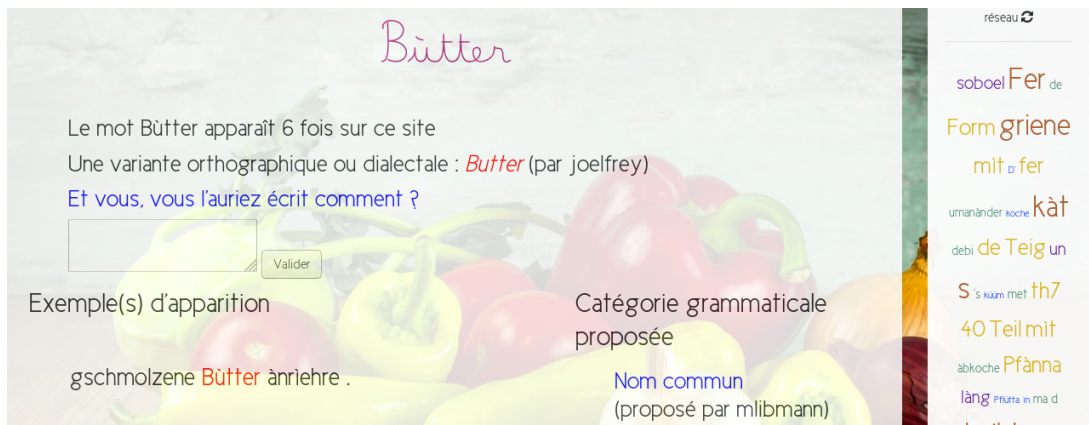
Figure 2: Spelling addition using the wordcloud. The word is shown in its context, with the proposed part-of-speech (if available).