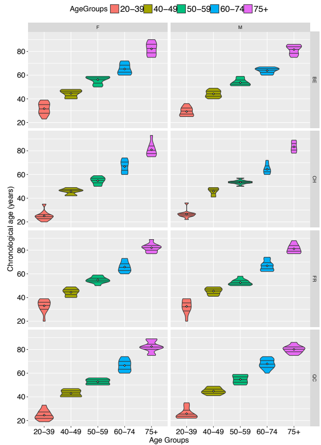
Figure 1: Age characteristics for each age group, per regiolect and sex

This work was partially supported by the program "Investissements d'Avenir" ANR-10-LABX-0083 (Labex EFL), the Swiss FNS Grant N. CRSII5_173711 and the Fonds National de la Recherche Scientifique (Belgium).