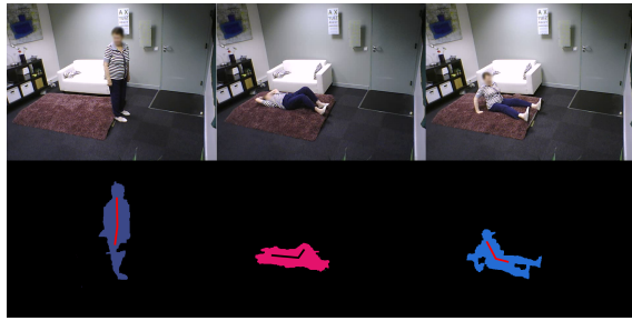
Figure 4: Event detection, results

on comparison of two histograms i.e. key pose frame histogram and histogram of frame in hand (Barnachon et al., 2012). The histograms were then compared with the Bhattacharyya distance and warped by a dynamic time warping process to achieve their optimal alignment (Barnachon et al., 2014). Bhattacharyya distance is calculated using: