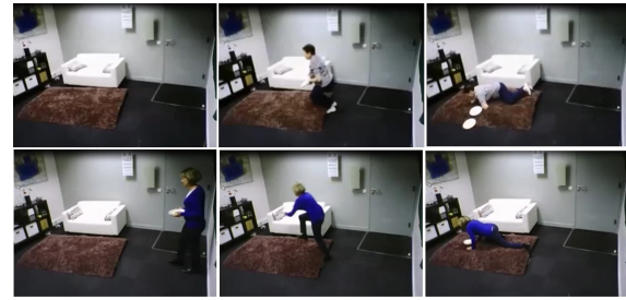
Figure 2: Excerpt of 2 video records showing each the fall of an elderly participant.

Ideally scenarios should be played by elderly people. However, it is cumbersome to find elder person who is capable and willing to play such scenarios (refer Section 2.2.). To record realistic data (but not necessarily played by elder person), people under 60 were recruited. Then, these volunteers were instructed to wear an equipment i.e. old age simulator (see Figure 1). Old age simulator hampered mobility, reduced vision and hearing. Overall 17 participants were recruited (9 men and 8 women) with mean age of 40 years (SD 19.5). Among them 13 people were under 60 and worn the simulator.