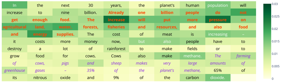
(a) Hunting condition (with question preview)

What will result from an increase in human population in the future?