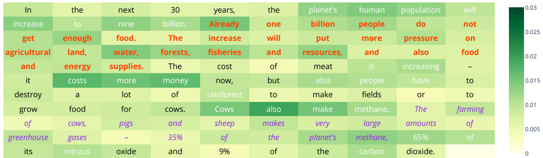
(b) Gathering condition (without question preview)