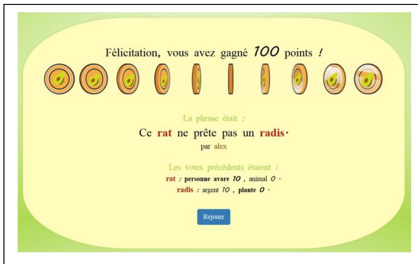
Figure 2: A screenshot of the game result. The player earns the same number of points and credits, here 100.

Players earn two types of rewards, points , only for fame, and credits that can be used for typical game actions, such as creating oneself an ambiguous phrase or adding a gloss: indeed, during the game, a player may add his own gloss, if he feels that none of the proposed ones is appropriate. The amount of points earned is related to the distribution of other player answers. (Of course, the main hypothesis, which is verified experimentally, is that globally , players provide the adequate answers).