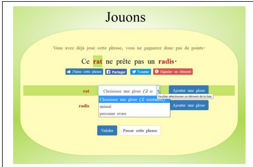
Figure 1: An Ambiguus play with the sentence Ce rat ne prête pas un radis.