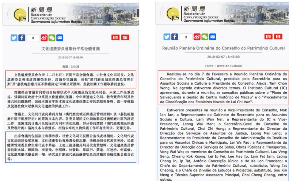
Figure 1: An example from The Government Information Bureau website. The texts in the boxes with the same color are parallel data.

pus. The experimental results show that the performance of Chinese–Portuguese MT has significantly improved and outperforms the results using pivot-based method. The contributions of this paper are listed as follows: