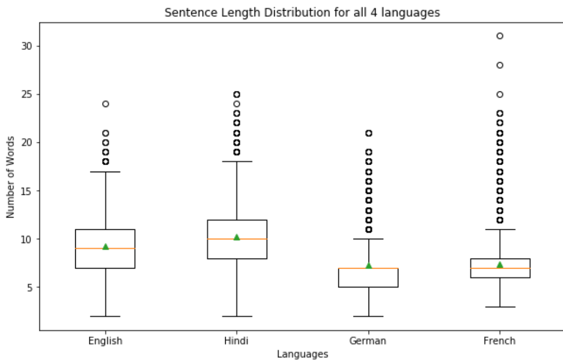
Figure 5: Box plot of disfluent sentence lengths across all languages in DISCO corpus