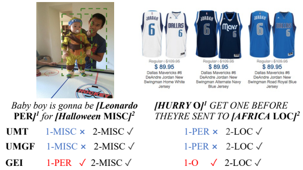
Figure 3: Case study of our proposed GEI, previous SOTA methods UMT and UMGF. The bottom three rows are predicted entities of different approaches.

Visualization of Entity-level Interaction. To gain an insight into the interaction between entities and visual objects, we visualize the cross-modal attention weights between entity nodes and visual object nodes for the example appearing in Figure 1. As shown in Figure 4, it is obvious that two PER entities "Attenborough" and "Ben Kingsley" have greater weights with two person objects than other visual objects during cross-modal interaction. The same phenomenon exists between the MISC entity "Oscars" and two trophy objects. These find-