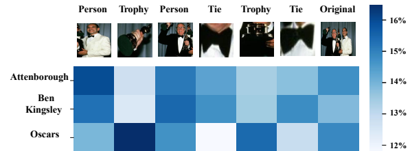
Figure 4: Visualization of cross-modal interaction attention between entity representations and visual objects.

ings confirm that our framework can effectively capture entity-related visual information through entity-level cross-modal interaction.