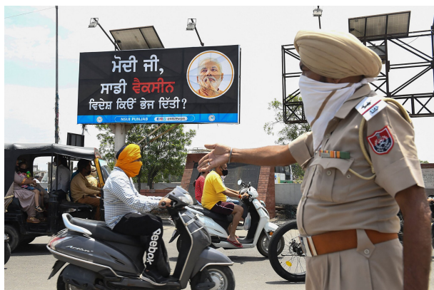
Figure 2: What is the time and location for this image?