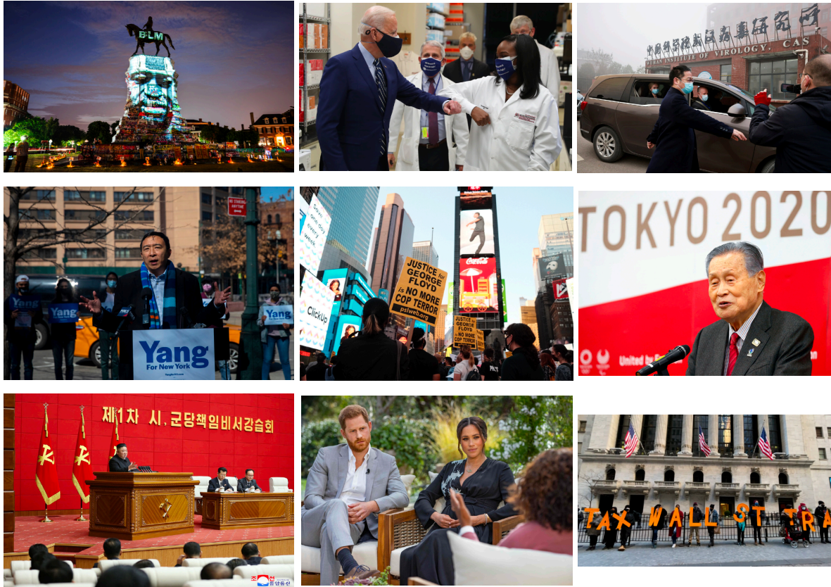
Figure 5: Some example images in our test set of interest as described in Section 3.3. These very recent images require open-ended reasoning with world knowledge and are specifically chosen such that our human baseline annotators probably have enough knowledge about the key evidence. For example, in the first image, people need to know what “BLM” is so that they can start to search statues in United States. Also in the second image, people need to know it is the President Biden for further reasoning.