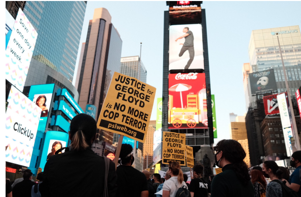
Figure 1: This is an image from the New York Times. Can you tell the time and location when it was taken?

Vision and language are two of most important information sources, and the fact that humans reason jointly with both sources has motivated artificial intelligence research to consider visually-grounded