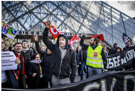
Union workers protested the government's pension plan outside the Louvre in Paris on Friday.