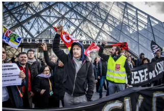
Image Caption: Union workers protested the government's pension plan outside the Louvre in Paris on Friday..

Look at this image extracted from a NYT article again. Read its caption, article publication date, article headline and article abstract. Answer the questions.