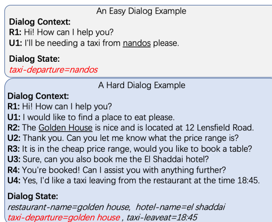
Figure 1: An easy and a hard dialog example for DST.

model training in an easy-to-hard manner, imitating the meaningful learning order in human curricula. This paradigm is called curriculum learning (CL) (Bengio et al., 2009) and has been shown useful in various other problems (Wang et al., 2021). DST training examples also vary greatly in their difficulty levels. As shown in Figure 1, for the same slot ‘ taxi-departure ’, a user can either inform its value ‘ nandos ’ explicitly in a simple utterance or convey her intention implicitly via multi-round interactions, requiring a complex inference process to find the value ‘ golden house ’ referred by the slot ‘ restaurant-name ’. However, CL has been rarely studied in DST, and models are often trained with dialog data in a random order.