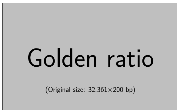
Figure 1: A figure with a caption that runs for more than one line. Example image is usually available through the mwe package without even mentioning it in the preamble.

Using the graphicx package graphics files can be included within figure environment at an appropriate point within the text. The graphicx package supports various optional arguments to control the appearance of the figure. You must include it explicitly in the L A T E X preamble (after the \documentclass declaration and before \begin{document} ) using \usepackage{graphicx} .