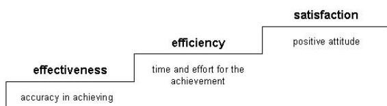
Fig. 2: Hierarchical steps of Usability based on ISO 9241-11 (1998)