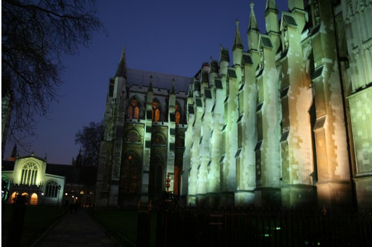
Figure 2: Example image