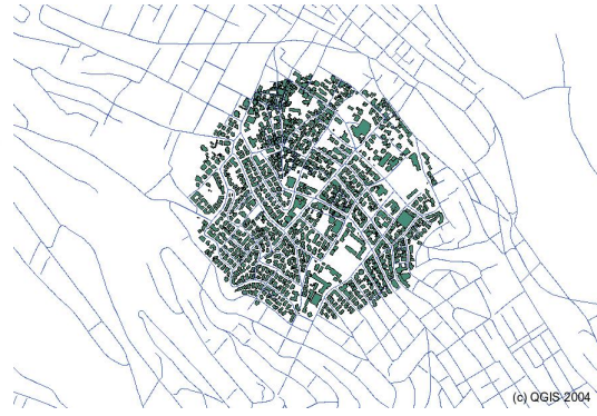
Fig 2. Query result in QGIS

with more than 10 floors. We achieve the correct semantics in this case by providing a \lambda SQL expression for verbs such as contains that existentially quantifies over the set of contained objects: \lambda n1.\lambda n2.\lambda x.\exists y.(n1(y) \text{ AND } n2(y) \text{ AND } contains(x.the\_geom, y.the\_geom)) .