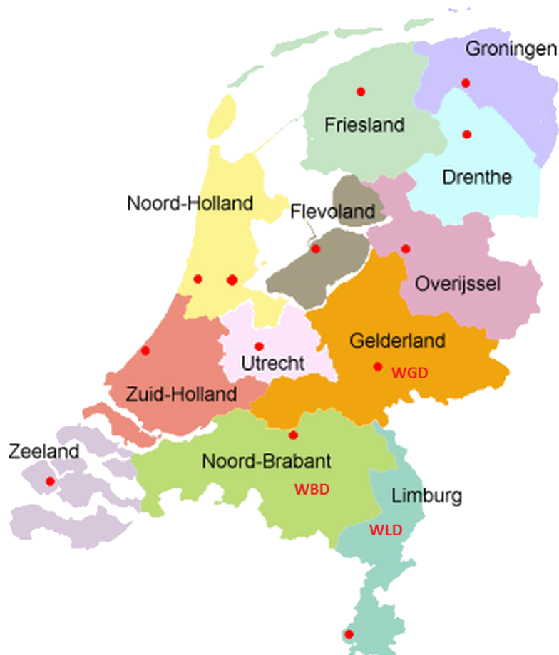
Figure 1: The locations of WBD, WGD and WLD shown in a map with the Dutch provinces.