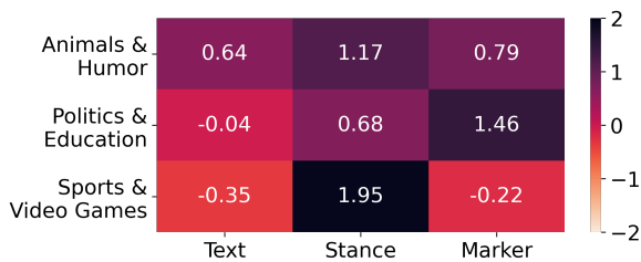
Figure 2: Topic-topic similarities for each of our three representations for pairs of interest. Colors and z-scores are the same as in Figure 1.

is consistent with particular traits. Our final example illustrates that communities with almost no similarity in their content (Sports and Video Games) can be extremely similar in how their stances relate to that content (highlighting a critical difference between stance contexts and textual similarity), but may yet demarcate their stances differently (highlighting the difference between stance contexts and stance markers). Overall, our results show that our three representations are distinct yet complementary, and provide a holistic view of community variation in language and community identity.