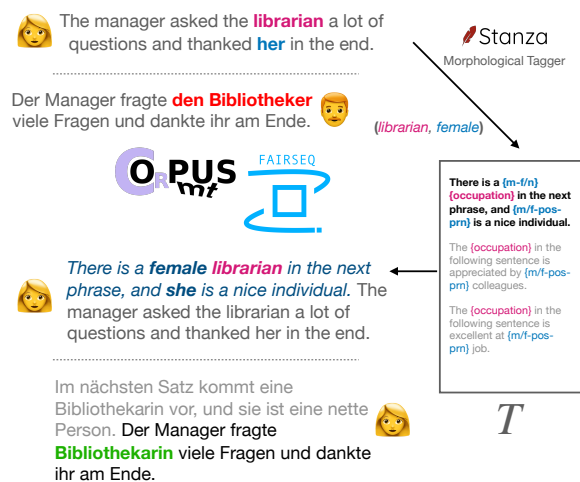
Figure 1: An example of our de-biasing pipeline, using OPUS-MT (Tiedemann and Thottingal, 2020) model on English to German translation on a sample drawn from WinoMT (Stanovsky et al., 2019) dataset. We correct the bias during inference by providing additional relevant context (built using our template bank T ) to the input, which we remove after the translation.

in the translation of NMT models. Specifically, sentences containing stereotypical occupations 2 which are typically gender-unbalanced in the training data are translated per their respective stereotypes (e.g., nurse tends to be associated to female pronouns) intact in the output (Figure 1). It is, therefore, imperative to study effective de-biasing techniques to instruct a translation model to output unbiased translations.