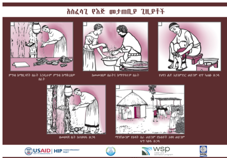
Figure 2: An Amharic illustration of translation of water, sanitation, and hygiene (WASH) guidelines in Ethiopia (USAID, 2009).