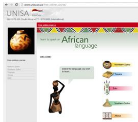
Figure 1. Learn To Speak an African Language ( LetsAL )

In an initiative to actively promote African languages in anticipation of the Soccer World Cup that took place in South Africa in 2010, a modest beginning was made with the development of free online courses that focus on basic language skills (Mischke, n.d.).