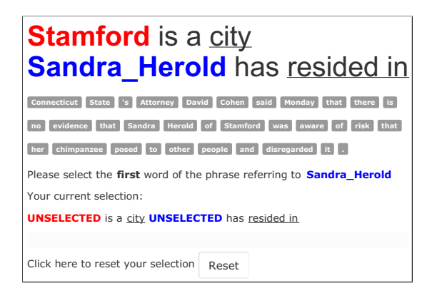
Figure 8: Example of an LDC examples HIT on Mechanical Turk for identifying the mention spans. The annotator is presented with a sentence obtained from the HIT shown in Figure 7 as well as the corresponding extraction and asked to identify the spans of the subject and object mentions in the extraction.

International Amateur Boxing Association president Anwar Chowdhry, who is from Pakistan, defended the decision to stop the fight. C Anwar Chowdhry is an employee or member of International Amateur Boxing Association (note: politicians are employed by their states, musicians are employed by their record labels) C International Amateur Boxing Association is a school that Anwar Chowdhry has attended C No relation/not enough evidence C Entity is missing/sentence is invalid (happens rarely)