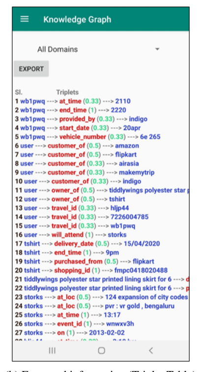
(b) Extracted information (Triplet Table)