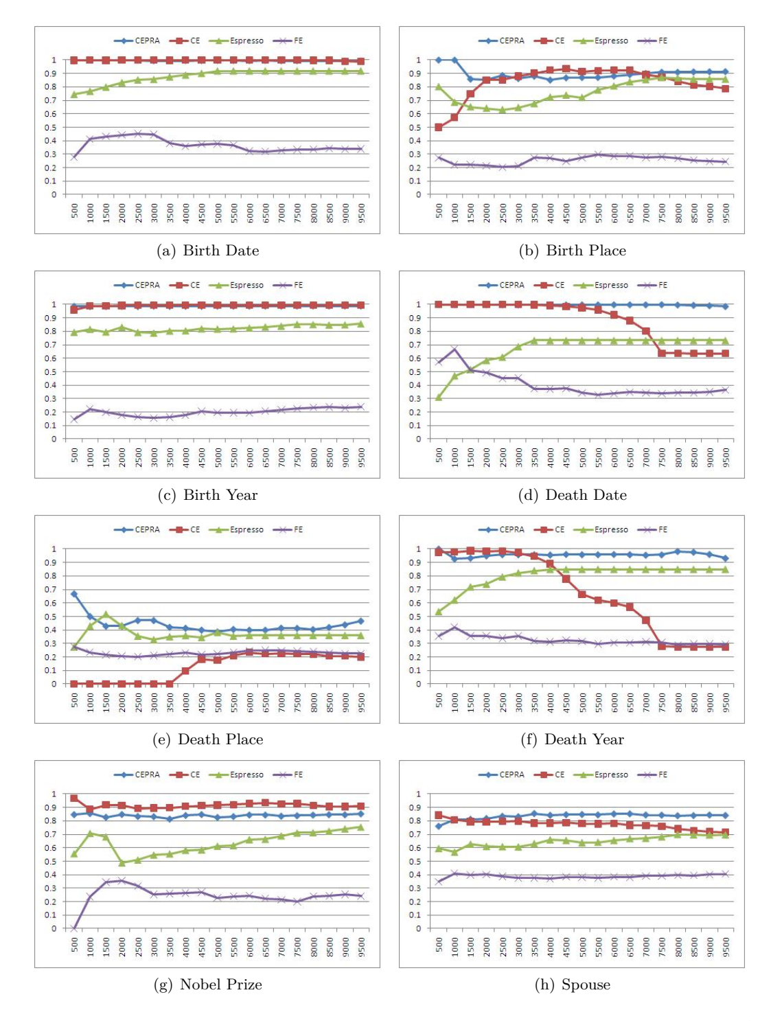
Figure 3: Precision of the Top N ranking patterns of the four compared approaches, CEPRA, CE, FE and Espresso. The x-axis represents the precision value and the y-axis represents the number of N.