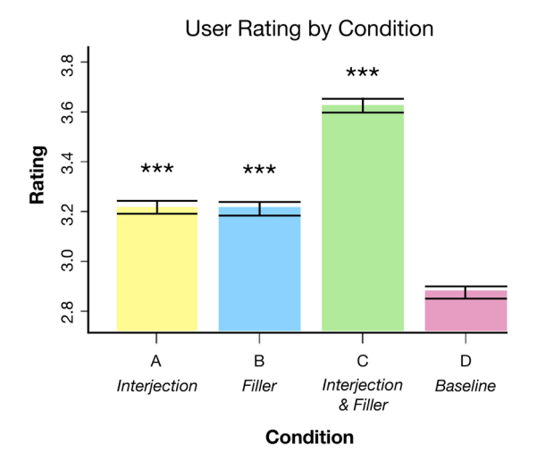
Figure 2: Mean user rating by Condition (error bars represent standard error; asterisks depict significance (p<0.001) relative to the baseline condition, "D")

The releveled linear regression model, with Condition C as the reference, tested whether the combined condition (Interjections & Fillers) showed higher ratings relative to the addition of interjections or fillers alone. Results revealed that Condition C indeed showed higher user ratings than Conditions A (Interjections only: \beta =-0.561, t=-26.16, p<0.001) or B (Filler only: \beta =-0.326, t=-15.33, t<0.001).