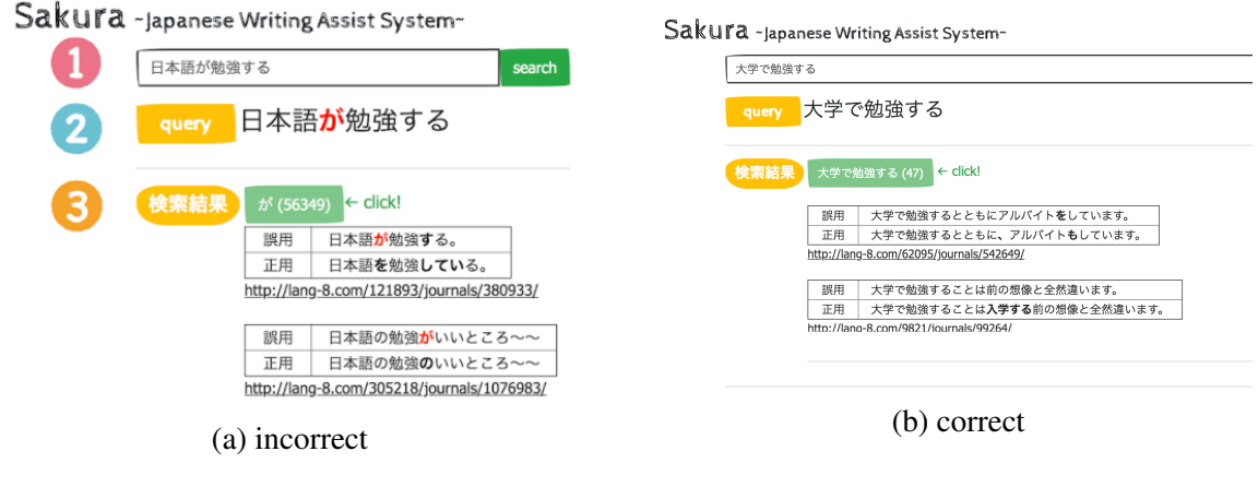
Figure 1: User interface of our system.