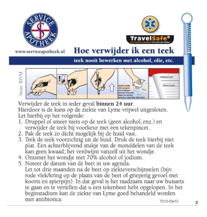
Figure 2: MI15 - www.serviceapotheek.nl