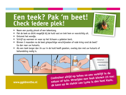
Figure 1: MI14 - www.ggddrenthe.nl

with dedicated tick-removal tools. Figures 1 and 2 present two examples to illustrate the variation in the corpus (e.g., position of text and pictures, number of steps, amount of text per step, inclusion of additional information in either text or pictures). The corpus annotation was developed and refined in close discussion between the authors of this paper, with the second author taking the lead in the majority of the analyses in the context of her MA thesis (Eppinga, 2017).