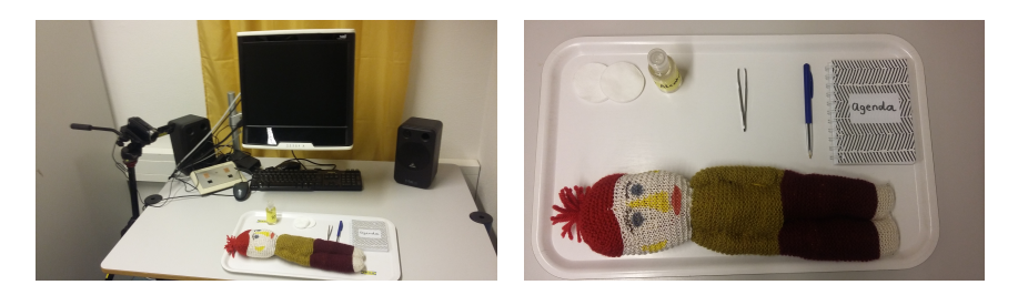
Figure 5: Experiment setting.