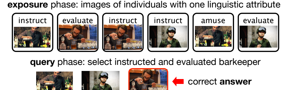
Figure 1: Cross-modal tracking task (actual datapoints contain 12 exposures and 6 images to pick from).

very same image. The current setup is nevertheless already very challenging for current models, as the experiments below will show. Indeed, to succeed in the task a model must correctly associate the category in the query with images of the right object, it must develop a mechanism to index entities based on the images representing them, and it must learn to correctly accumulate over time the different attributes to be stored with each entity.