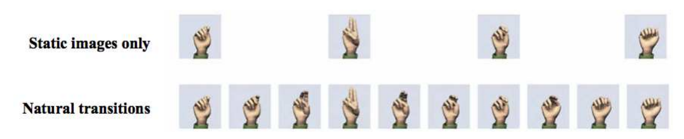
Figure 2: Still images vs. animation: fingerspelling sequence T-U-N-A in American Sign Language [5]