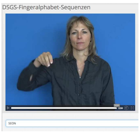
Figure 3: Study interface: screenshots

In the resulting set of items, each letter of the DSGS finger alphabet occurred at least once (with the exception of -X-, which did not occur in any of the town names that met all of the above criteria).