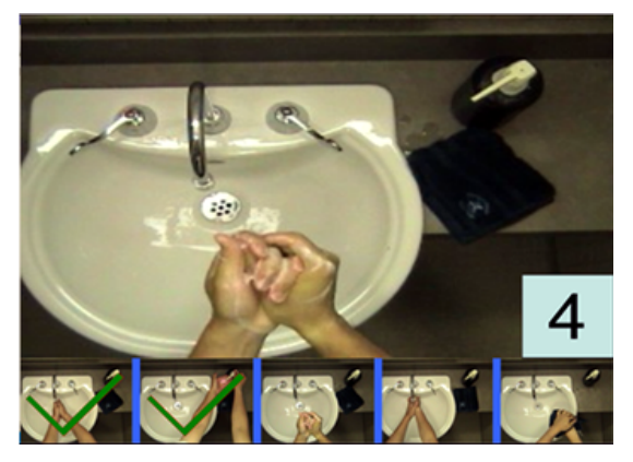
(b) On-screen prompting