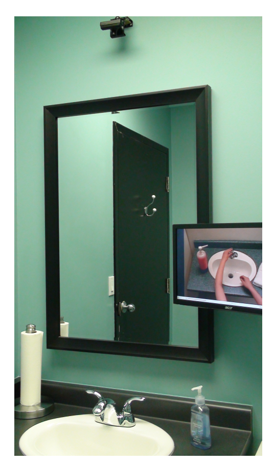
(a) Environmental setup

These strategies, though often based on observational studies, are not necessarily based on quantitative empirical research and may not be generalizable across relevant populations. Indeed, Tomoeda et al. (1990) showed that rates of speech that are too slow