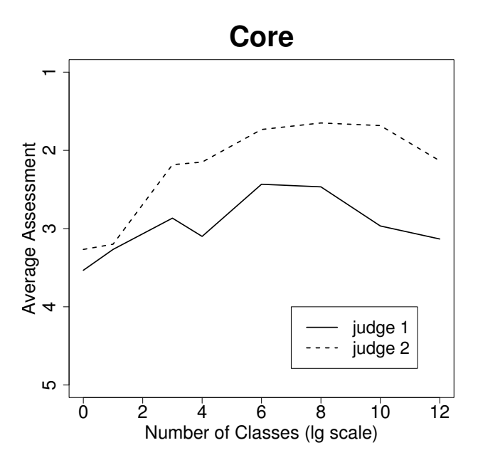
Figure 4: As a function of frequency of support, average assessment for propositions derived from core sentences