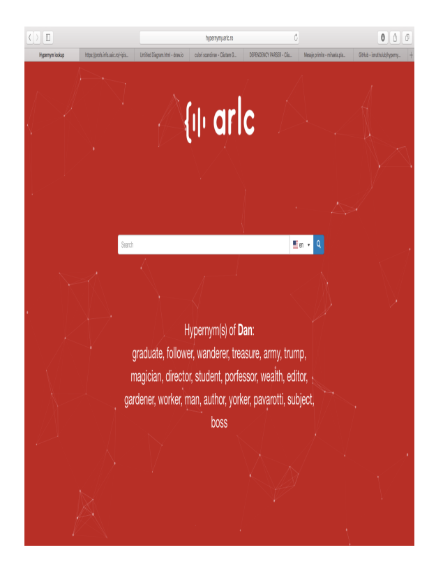
Figure 2: Project's interface

The interface<sup>5</sup> was implemented in the form of a website. The site is backed by a Mongodb database. When a user types in a query and hits enter a post request is sent and the backend will do some processing on the query (tokenizing, lemmatizing) and then search in the database. The results are then sent back to the user where they are rendered.