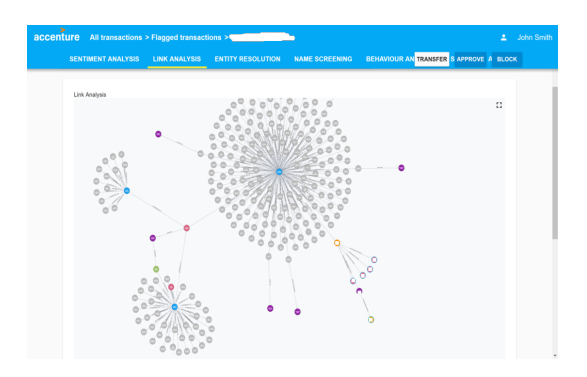
Figure 3: Knowledge Graph of Fraud Base: Each Node is an entity and edges are relations. Sensitive entities are blocked with white boxes according to data privacy agreement.

The name screening module filters out ML offenders or criminals have previous records of fraud, illegal activities (e.g. terrorism) and financial crimes by looking at a sanction list or ML cases from bank records and other fraud bases. The name screening employs fuzzy matching techniques as an initial filter like many off-the-self AML solutions. If the target entity is matched with some entities in the list, it will increase the probability of a ML transaction, so the system is triggered for more evidence gathering.