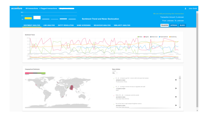
Figure 2: Sentiment Analysis of Target Entity

The main UI of our system is shown in Figures 2–4. We will explicitly detail the functionality of each NLP module while following the work-flow of the system: