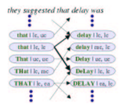
Figure 1: Given individual histories, the decodings delay and DeLay , are most probable - perhaps in the context of "time delay" and respectively "Senator Tom DeLay"

Using the language model probabilities we decode the case information at a sentence level. We construct a trellis (figure 1) which incorporates all the sentence surface forms as well as the features computed during training. A node in this trellis consists of a lexical item, a position in the sentence, a possible casing, as well as a history of the previous two lexical items and their corresponding case content. Hence, for each token, all surface forms will appear as nodes carrying additional context information. In the trellis, thicker arrows indicate higher transition probabilities.