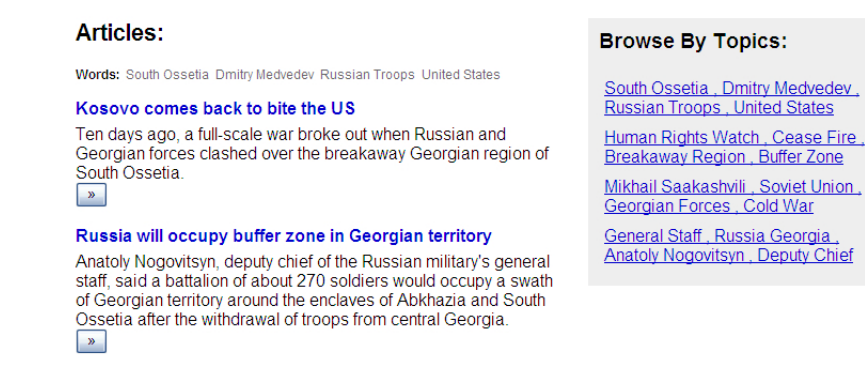
Figure 3: Using HIERSUM to organize content of document set into topics (see section 6.1). The sidebar gives key phrases salient in each of the specific content topics in HIERSUM (see section 3.4). When a topic is clicked in the right sidebar, the main frame displays an extractive 'topical summary' with links into document set articles. Ideally, a user could use this interface to quickly find content in a document collection that matches their interest.

focused in its content, not conveying irrelevant details? The study had 16 users and each was asked to compare five summary pairs, although some did fewer. A total of 69 preferences were solicited. Document collections presented to users were randomly selected from those evaluated fewest.