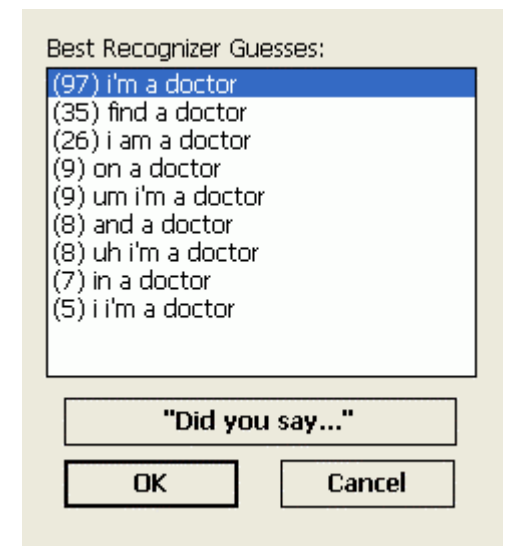
Figure 2. Sample ordered list of recognizer hypotheses.

the input speech is in Pashto, this functionality is less useful, as the Pashto speaker is not assumed to be able to read, even if the hypotheses were displayed in Pashto script.