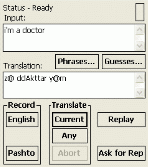
Figure 1. Screen shot of prototype system interface.

An English and a Pashto version of each component are called by a single application which includes a graphical user interface. A screen shot of the interface is shown in Figure 1.