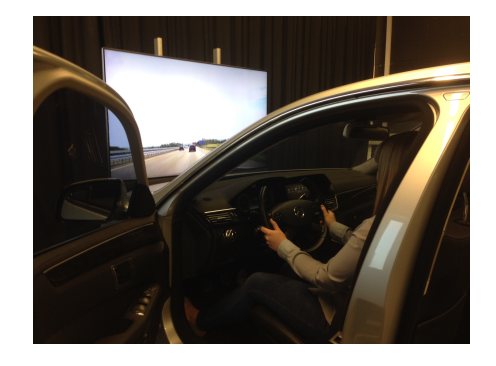
Figure 3: Driving Simulation Setup.

Considering that we wish to discover how users naturally interact with a SDS while driving, we place the participants in a simulated driving situation. The car in which the participants are placed is situated in front of a canvas onto which the driving simulation is projected, as done by Hofmann et al. (2014). In the driving simulation, the participants drive behind another vehicle and they have to brake if and only if the preceding vehicle brakes. The setup is illustrated in Fig. 3.