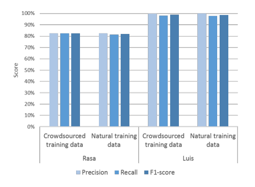
Figure 4: Average scores of intent classification and entity recognition: crowdsourced vs. natural data.

First, the NLU services are trained on crowdsourcing data as well as on 60% of the system usage data. As crowdsourced data, we use the utterances which are classified as valid utterances (cf. section 4.1.). The labels created by the services are then compared against 40% of our system usage gold standard data. Fig. 4 shows that the average F_1 scores are very similar between crowdsourced training data and system usage training data. The models that are trained on crowdsourced data achieve very good results when tested on gold standard data.