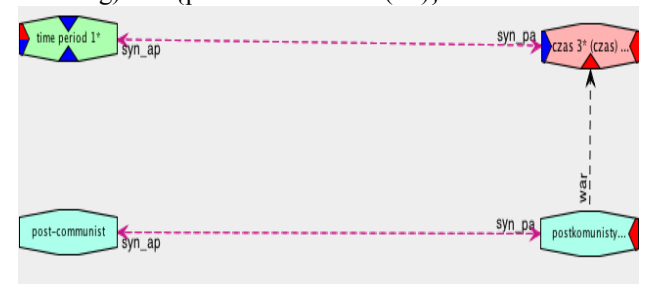
Figure 3. Application screenshot of the relation network of the Polish synset {postkomunistyczny 2 (jak)} Both {postkomunistyczny 2 (jak)} 'occurring after communism' and {post-communist 2 (rel)} 'no longer communist; subsequent to being communistic' refer to

Productive affixal adjective derivation in Polish is not the only source of mapping problems. Another issue is domain mismatch. plWN and PWN semantic domains only partially overlap (see Section 2). This motivates the necessity of establishing inter-lingual relations between plWN and PWN adjective synsets belonging to different domains. In Table 6, we present the statistics of crossdomain mappings. The most interesting piece of data is the number of links established between plWN qualitydenoting adjectives and PWN relational adjectives, which is 2271. One would expect plWN quality-denoting adjectives to be mapped rather on PWN adjectives from the general 'adj' domain. The most troublesome cases are those in which plWN quality-denoting adjectives and PWN relational adjectives are to be linked by means of (full) I-synonymy due to the fact that establishing any other inter-lingual relation would falsify the semantic correspondence between lexical units forming the synsets in question. In such cases, lexicographers choose to violate the requirements posed by wordnet design, i.e. not using I-synonymy to link adjective synsets of different domains, and establish I-synonymy relation between the synsets. To illustrate this, consider the synsets {postkomunistyczny 2 (jak)} - 'postcommunist' (qualitydenoting) and {post-communist 2 (rel)}: