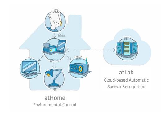
Figure 1: Diagram of the two distinct parts in the home-Service system: the atHome in users' home and the at-Lab 'in-the-cloud' components. One user is illustrated, but the cloud-based ASR server enables simultaneous speech recognition from many participants.

The homeService project is an impact showcase for the UK EPSRC Programme Grant Project, Natural Speech Technology (NST) (The Natural Speech Technology (NST) Programme Grant, 2015), a collaboration between the Universities of Edinburgh, Cambridge and Sheffield.