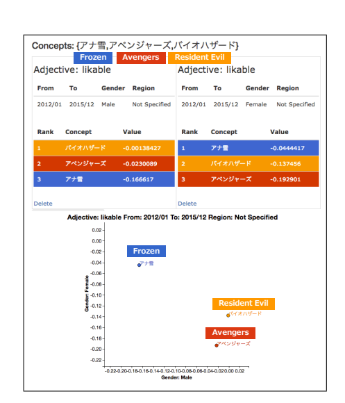
(c) Users can compare orderings with different settings. This example compares movies (Frozen, Avengers, and Resident Evil) in terms of 'likable' with two genders.