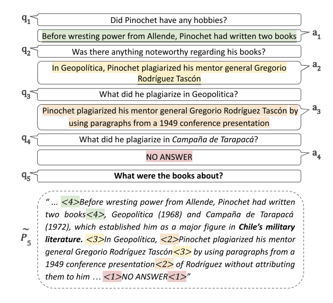
Figure 3: The MarCQAp highlighting scheme: Answers to previous questions are highlighted in the grounding document, which is then provided as input to the model.