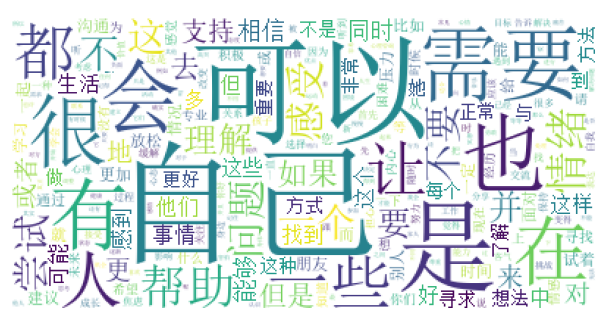
Figure 4: Word cloud map of psychological consultants' utterances (English version: Appendix D).

not publicly available due to the privacy protection and ethical standards of psychological counseling. To construct high-quality multi-turn empathy conversation dataset, We selected 12 topics of psychological counseling to construct 215,813 long-text questions and 619,725 long-text answer through crowdsourcing. The distribution of topics is shown in Figure 3. Then, we used ChatGPT (99% called gpt-3.5-turbo api and 1% called gpt-4 api) as a text rewriting tool following the prompt as shown in Figure 2 to convert single-turn psychological counseling conversations to multi-turn empathy conversations, in which one turn is in the form of "用 户: <user_utt>\n心理咨询师: <psy_utt>". The response of "心理咨询师" was asked to be rewritten to reflect human-centered expressions such as empathy, listening, comfort, etc. Finally, after manual proofreading, we removed 105,134 low-quality samples and ultimately obtained 2,300,248 samples. As shown in Figure 4, the word cloud map of the utterances expressed by psychological consultants indicated that the rewritten multi-turn empathy conversation has high level of empathy.