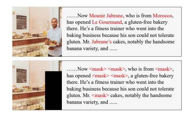
Figure 1: The original multi-modal information (upper) and the modified multi-modal information in Article Degradation and Image Cover experiments (below)

entities randomly with the same rate. Through article degradation experiments, we can analyze the way images help generating the specific entities: generating them from scratch or assist models to select the right entities appearing in textual context.