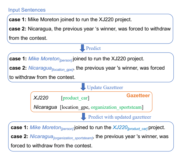
Figure 1: Two motivating examples and the overall process to fix errors by updating the gazetteer.

Typically, to fix those bad cases, model developers need to (1) annotate the input sentences causing errors with correct labels, (2) combine newly annotated sentences with existing training data, (3) train and tune a new model with the new training data