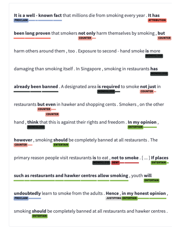
Figure 1: A sample output of the best-performing system reported in this study. The excerpt was taken from the ICNALE corpus (Ishikawa, 2013).

Automated writing evaluation (AWE) systems make it possible to assess students' writings and provide useful feedback efficiently (Shermis & Burstein, 2013). From the language assessment perspective, however, usefulness is multifaceted (e.g., Bachman & Palmer, 1996) and, in many parts, depends on what areas of writing ability a given system can measure and give feedback on (Huawei & Aryadoust, 2023). While many AWE systems to date focus on lexical, syntactic, organizational, and topical aspects of students' writing (e.g., Attali, 2007), the construct of writing (i.e., writing skill) is known to be far more complex and includes pragmatic and rhetorical knowledge