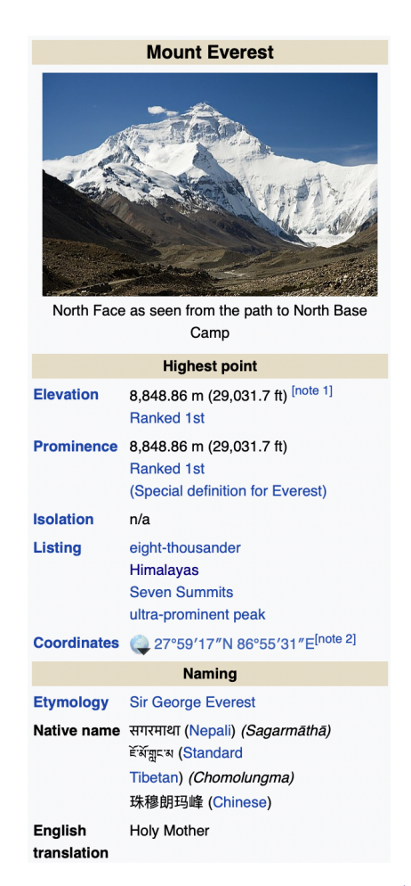
Figure 4: An example infobox with groups 14.

Figure 4 shows an example infobox that includes multiple groups. In this example, we can see two groups named with "Highest point" and "Naming". The headers "Elevation", "Prominence", "Isolation", "Listing", and "Cordinates" are grouped into "Highest point". The headers "Etymology", "Native name", and "English translation" are grouped into "Naming". The headers have corresponding values