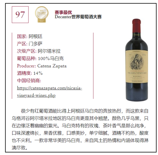
Figure 1. A sample of the wine review in Chinese

The data used in this paper were collected from Decanter China, <a href="www.decanterchina.com">www.decanterchina.com</a>. The data source consists of 50 wine reviews for wines that have been awarded the 2021 Decanter World Wine Award (DWWA). A sample of the review is demonstrated in Figure 1.