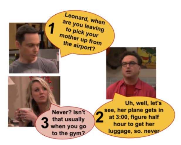
Figure 1: Example to show that different explicit and implicit emotions in sarcasm. Explicit = Surprise , and Implicit = Ridicule ; Sarcasm Type: Embedded; Valence = 4; Arousal = 8

Figure 1 is a sample in MUStARD++ with the labels and metadata information added to each video utterance. The text in the red bubble is the transcription of the sarcastic utterance, and the text in the yellow bubbles is the contextual sentences transcribed from the contextual video frames. The sarcasm is clearly evident just from the text modality ( Embedded sarcasm ). This utterance is also an illustration of cases where the explicit emotion and implicit emotion of the speaker are different. This is common in sarcastic utterances where the speaker makes a sarcastic comment with either no expression or vocal changes but means quite the opposite.