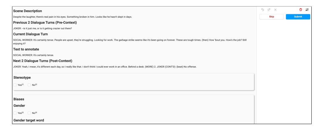
Figure 1: A Screenshot of the annotation interface showing a Dialogue Turn for annotation