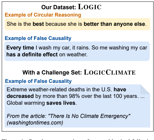
Figure 1: Our dataset consists of general logical fallacies (LOGIC) and an additional test set of logical fallacies in climate claims (LOGICCLIMATE).

<sup>†</sup>Done during the research internship at ETH Zürich. <sup>1</sup>Our dataset and code are available at https://