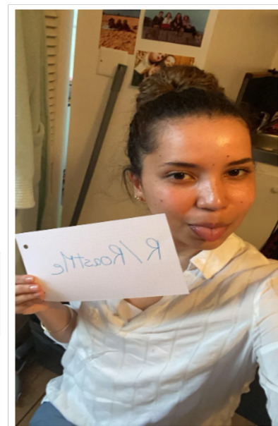
Figure 1: An example for two roasts (highlighter in yellow) from our RoastMe dataset and the photo they were directed to. We can see that the first comment is more overtly offensive and the second is more covertly offensive. This illustrates the diversity of the roasts, which may have been the key to the improvement of the classification model.